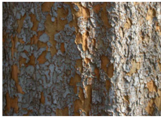
Unusual bark is the hallmark feature of this tree.