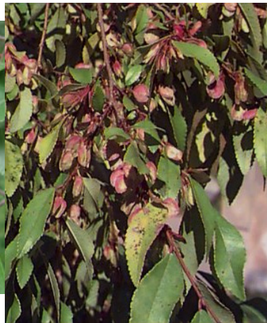
ripen to a russet brown in October...