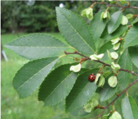
Lime green samaras emerge in September...

The Chinese elm is best known for having beautiful bark which exfoliates to reveal a colorful mixture of gray, green, orange, brown and olive. These colors are surrounded by orange lenticels, or pores which allow for exchange of gases between the flesh of the tree and the atmosphere. The vibrant trunk gives way to long, gracefully arching branches which have a "weeping" appearance, making the Chinese elm particularly attractive in winter.