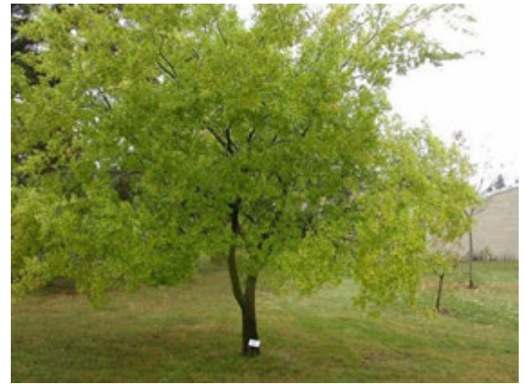
Arching branches give a somewhat "weeping" appearance

The Chinese elm is best known for having beautiful bark which exfoliates to reveal a colorful mixture of gray, green, orange, brown and olive. These colors are surrounded by orange lenticels, or pores which allow for exchange of gases between the flesh of the tree and the atmosphere. The vibrant trunk gives way to long, gracefully arching branches which have a "weeping" appearance, making the Chinese elm particularly attractive in winter.