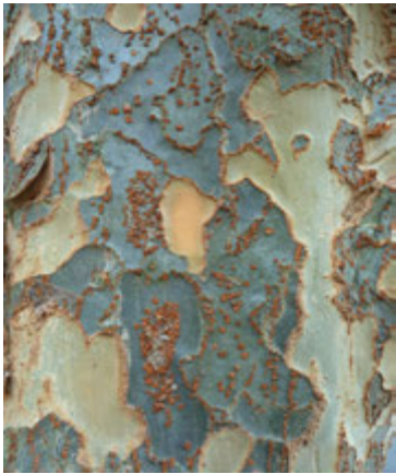
Eye-catching orange lenticels (pores in the bark that allow for the interchange of gases)