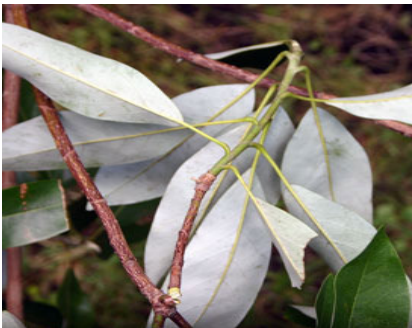
Silvery underside of the Sweetbay leaf

The bark of the Sweetbay is smooth and gray with a mild bay laurel scent. Leaves are a dark shiny green with a silver underside that gives them a frosted appearance (below left). The bright scarlet-red seeded fruit that ripens during late summer provides a fall food source for birds (below center). The magnolia is best known for its 2"-3" creamy white flowers (below right) which bloom from mid-May through early summer and produce a light lemon scent.