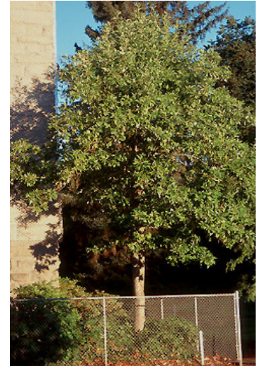
Tree form Sweetbay Magnolia

The bark of the Sweetbay is smooth and gray with a mild bay laurel scent. Leaves are a dark shiny green with a silver underside that gives them a frosted appearance (below left). The bright scarlet-red seeded fruit that ripens during late summer provides a fall food source for birds (below center). The magnolia is best known for its 2"-3" creamy white flowers (below right) which bloom from mid-May through early summer and produce a light lemon scent.