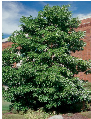
Shrub form Sweetbay Magnolia