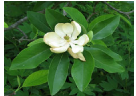
Trademark lemon scented blossoms

While the Sweetbay is not known for its vivid fall colors (right), it does produce shade during the summer months. It is also one of the most pest resistant varieties of magnolia and is able to withstand typical Missouri ice storms with minimal damage.