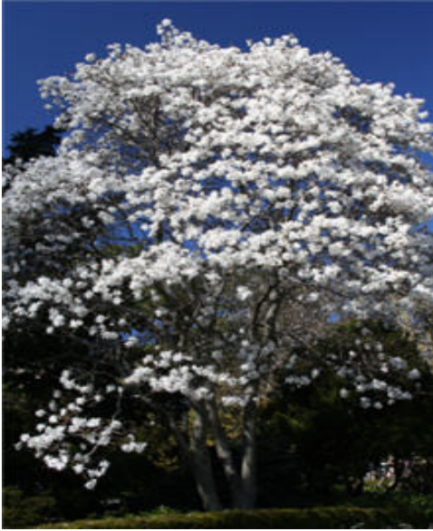
The Sweetbay Magnolia is prized for its proliferation of fragrant white blooms.

The Sweetbay or swamp magnolia is native to the southeastern United States. In the mild climates of the south, the magnolia remains green all year. In the more northern areas of its range, the tree is semi-evergreen or deciduous. It may be cultivated as either a multi-stemmed shrub or tree with a columnar shape (see below).